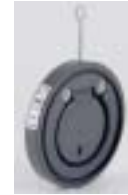
Astral Flap Valve