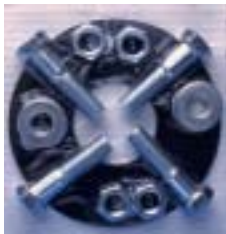
Flange Bolt Pack

Flange Bolt-Pack Kits - For assembly convenience, each kit contains everything you need to connect two flanges together: the correct number of bolts, nuts, and washers for 150-lb. flanges, and a neoprene full-face gasket (bolt pack only). All hardware is zinc- or stainless steel-plated. Call for specifications and information.