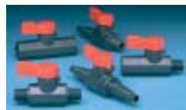
Lab Cock Valve

Astral Spring Check Valves – Injection molded PVC construction with EPDM o-rings.