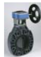
PVC Gear Operated Valve