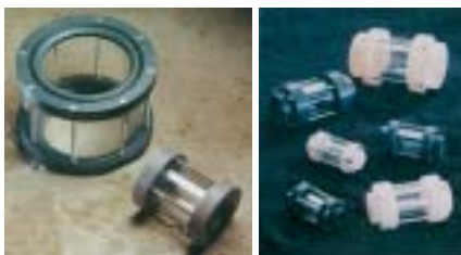
Sight Glasses / Flow Indicators

Water Sight Glass Flow Indicator - Available 1 1/2" to 8" pipe sizes.