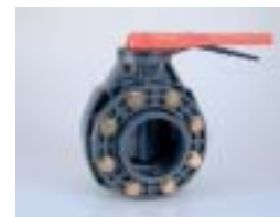
PVC Butterfly Valve