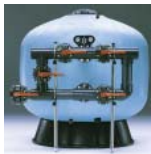
Vertical Polyester Filter