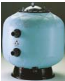
30" & 36" Filter