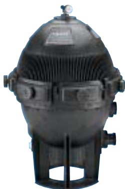
Sta-Rite Syst. 3

Astral 30" & 36" Series 3000 Filters – The 3000 Series filter is constructed of a one-piece injection molded thermoplastic. The internal components are constructed of PVC and Polypropylene. Multiport sold separately.