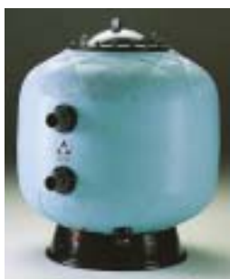
42" & 47" Filter