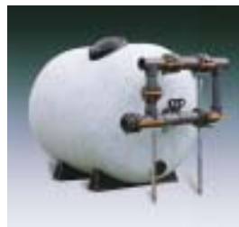
Horizontal Polyester Filter